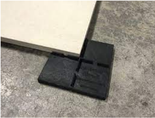
Dynamex rise-it paver pedestals