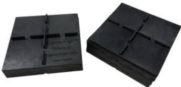
Dynamex rise-it paver pedestals