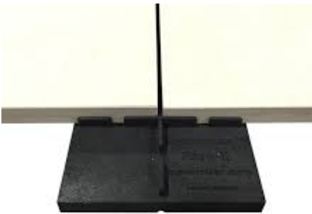
Dynamex rise-it paver pedestals