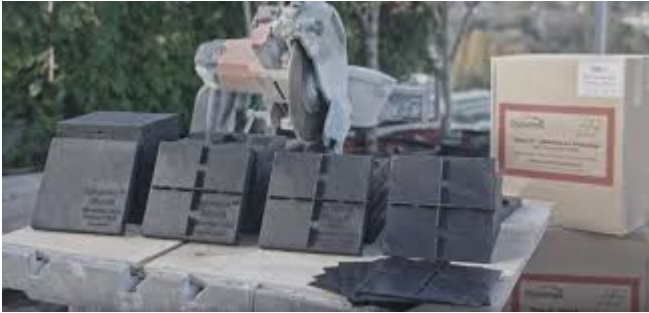
Dynamex rise-it paver pedestals