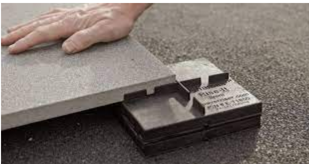
Dynamex rise-it paver pedestals