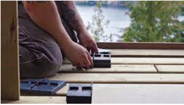
Dynamex rise-it paver pedestals