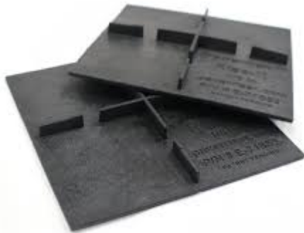
Dynamex rise-it paver pedestals