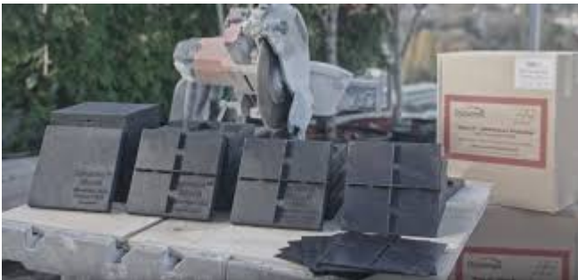
Dynamex rise-it paver pedestals